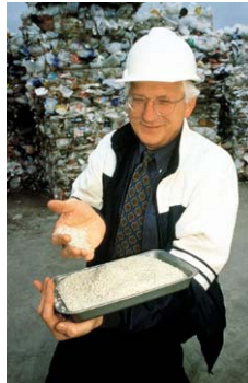
Food grade rPET