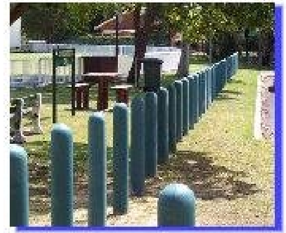
Repeat Plastics products